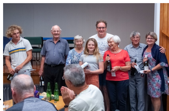
The Winning Quiz Team