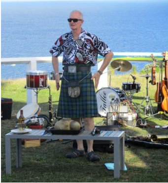
Summer Fun and Music at Tititiri Matangi on March 5 Haggis About to be Addressed