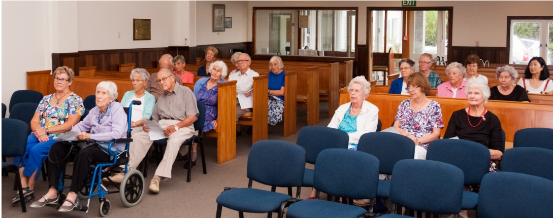
Communion Service on March 10th for those unable to Attend Sunday service