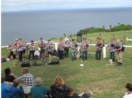
Pipe Band Entertains Concert Goers