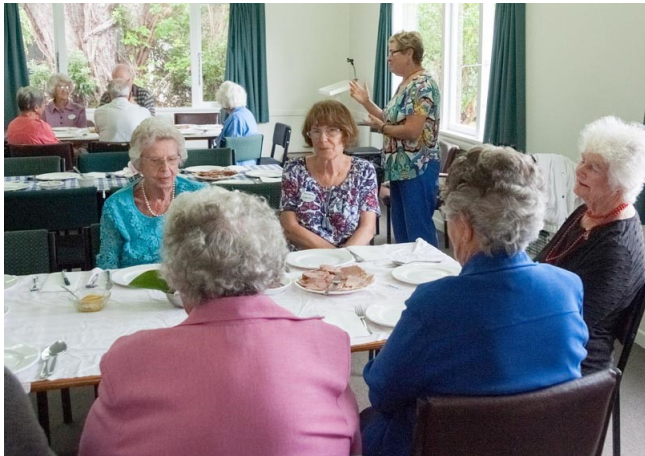
Lunch Following the Special Communion Service on March 10th