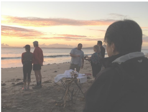
Dawn service—Easter 2017