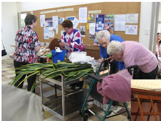
The trading table in full swing