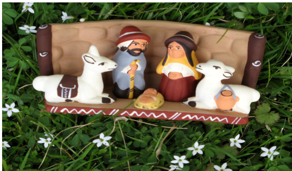
Peruvian crèche scene