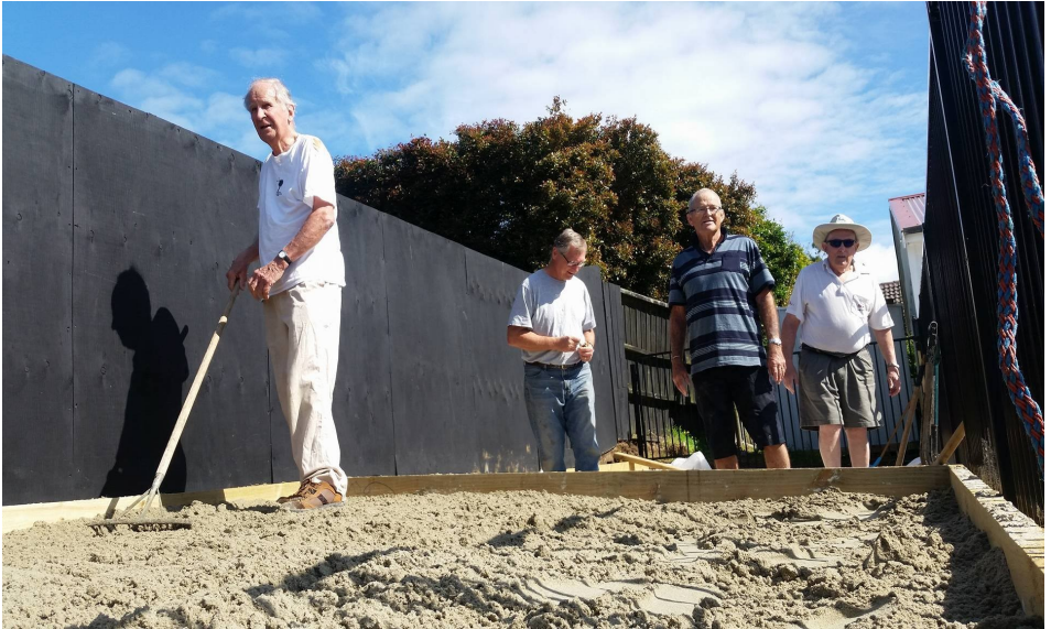
The Parish Council men were the first to play in the new sandpit