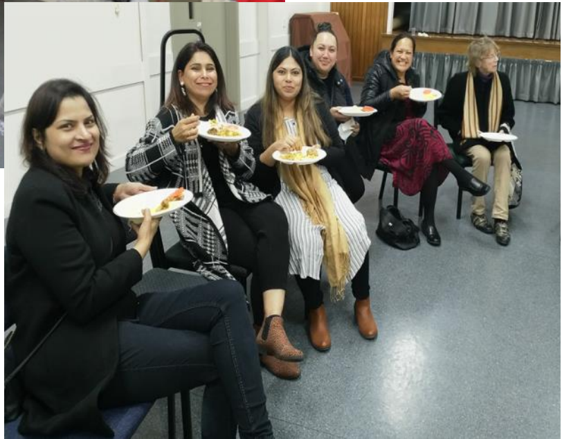
After the Hindi Service