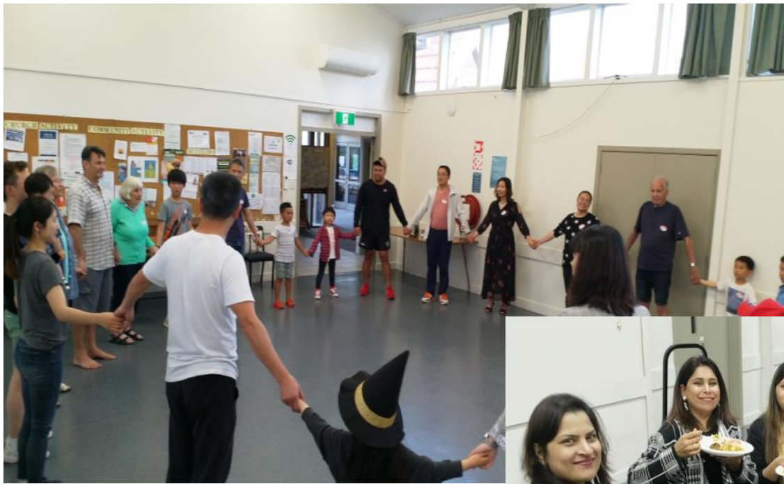
1st Friday of the month - Friday Night Games followed by a shared meal