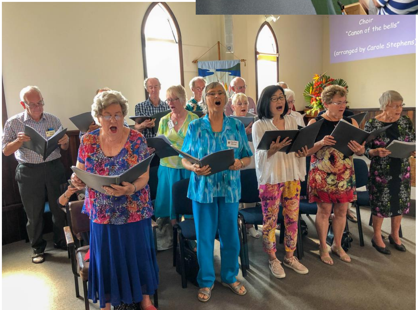
Choral Service - Choir