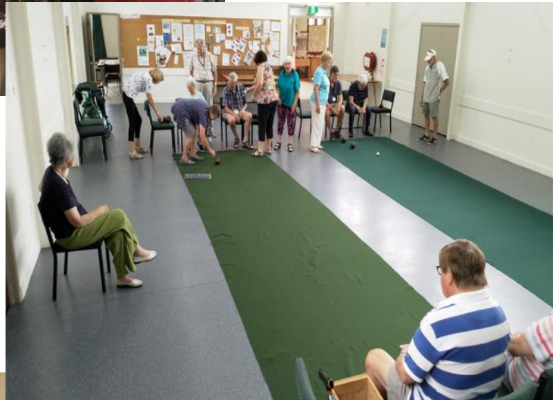
Dees Group Bowling