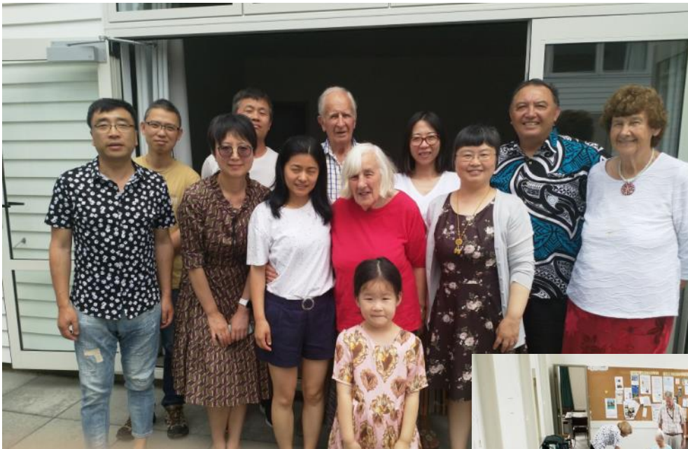
English Conversations Group